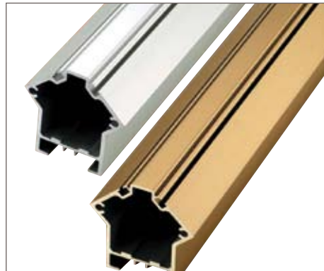
Straight rail available in silver or bronze

On straight stairs, the Solus runs along a strong rail with a slim line design and is fitted to the stairs, not to the wall, so installation is quick and clean. Straight rails are available in either silver or bronze.