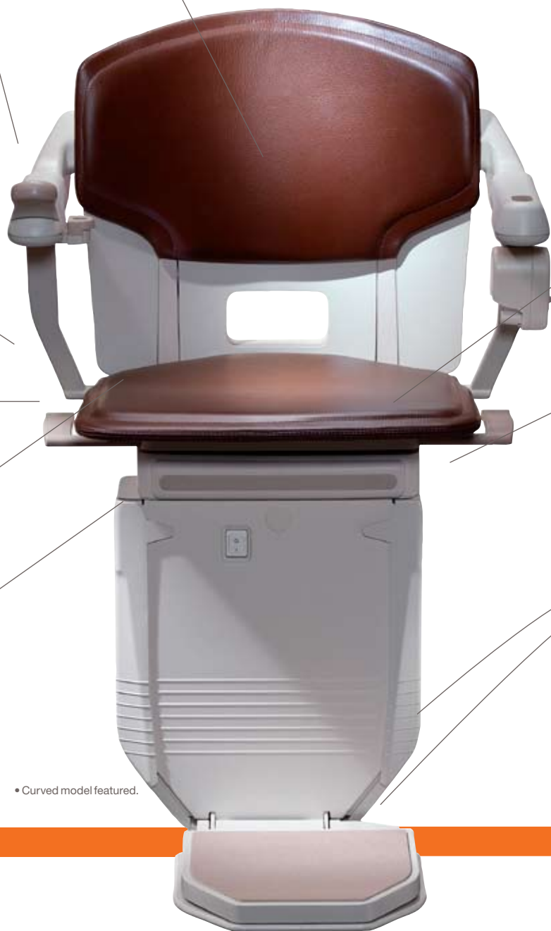
• Curved model featured.

Remote control allows you to call the stairlift to you or send it to someone at the bottom of the staircase.